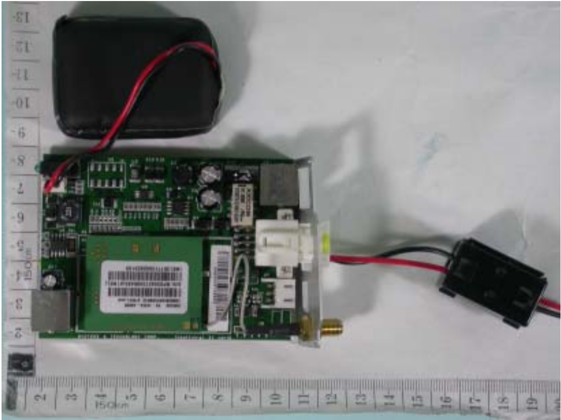
Figure Three : Internal front view of submitted test sample.