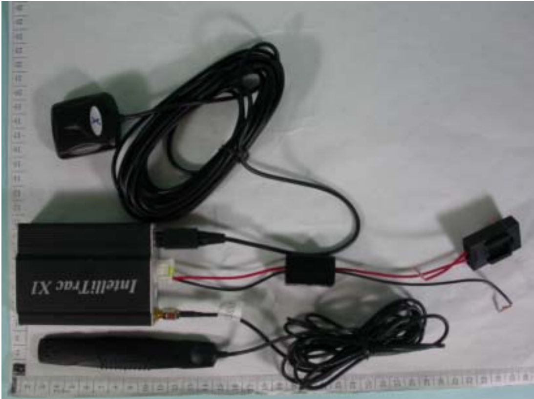
Figure One : External front view of submitted test sample.