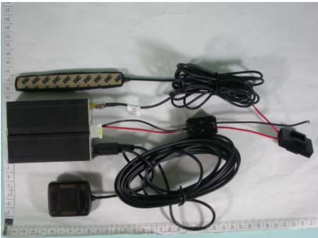
Figure Two : External rear view of submitted test sample